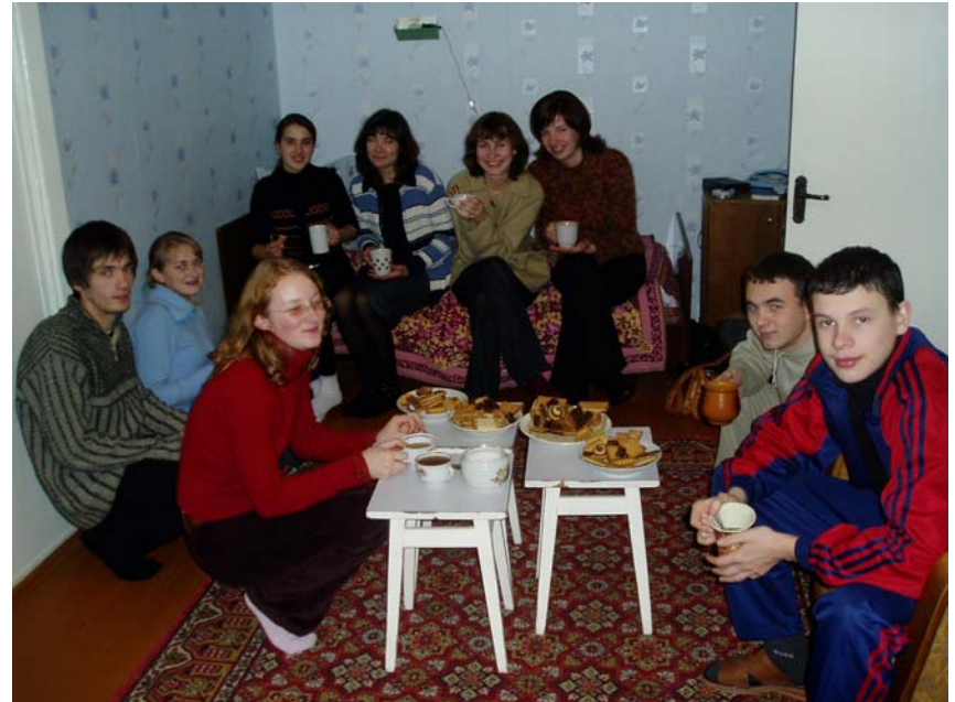
One of meetings

From November 2004 we had 5 meetings in Grodno.